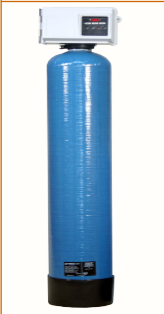
An Iron & Manganese filter with a Fleck 2510 valve, Clack valves also available.

When rain falls, the water has a naturally aggressive, slightly acidic nature. This water then dissolves chalk and / or metallic deposits present in the local rock strata, resulting in ground and borehole water containing elements that would not normally be present in mains water. Contaminants such as Iron and Manganese can cause problems such as poor tasting (and potentially harmful) drinking water & staining of appliances and equipment.