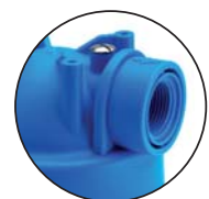
IN female plastic in/out threads 1/2", 3/4", 1", 1 1/4, 1 1/2